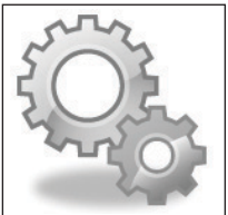
External Axis Control & I/O

Programming and connectivity is controlled through a simple USB interface to a laptop or desktop PC. Additional features such as external axis control, dedicated I/O, marking on the fly and camera assisted marking makes the Vereo™ a powerful tool for any production process.