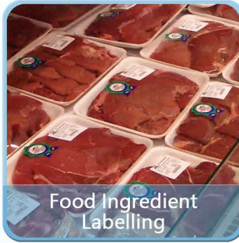
Food Ingredient Labelling