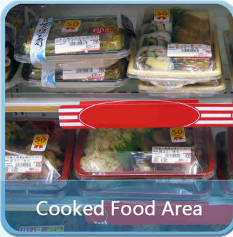
Cooked Food Area