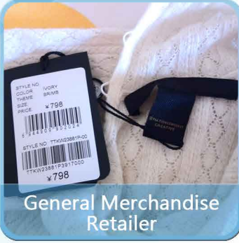
General Merchandise Retailer