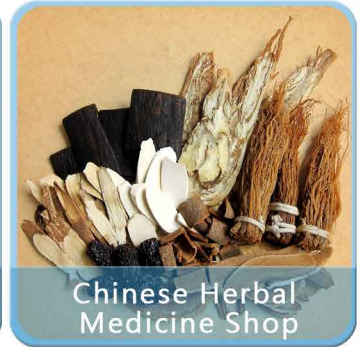
Chinese Herbal Medicine Shop